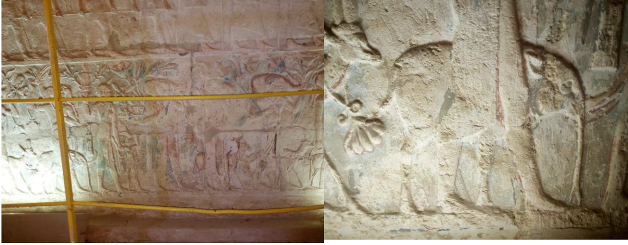
Fig. 5: Detail of previous scene

Fig. 4: Elephant scene in Petosiris Tomb