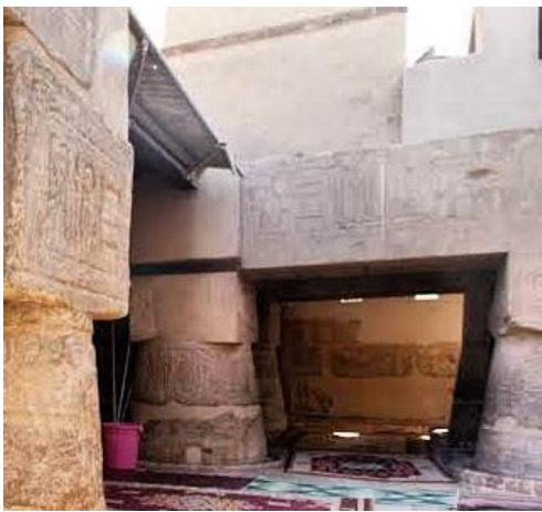
Fig. 2, a and b, inscription of elephant as a part of a ward from Abuel Hagag Mosque in Luxor a______ b