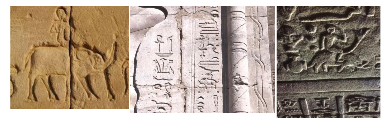
Fig 3c, Philae