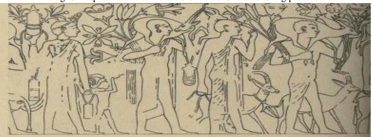
Fig. 6. Elephant scene at the tomb of Petosirs in an offering prossecion